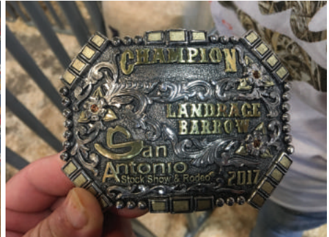
Breed Champion Landrace Barrow Division, awarded a $10,000 scholarship!