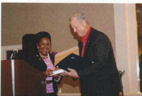
U.S. Capitol Flag from Congresswoman Sheila Jackson Lee