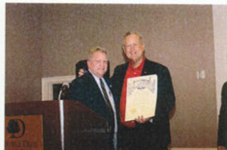
Receiving Proclamation from Mayor Sylvester Turner's Rep