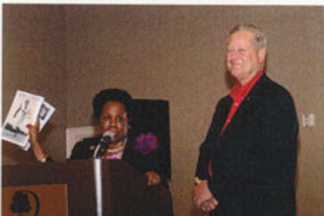
Congressional Certificate from Congresswoman Sheila Jackson Lee