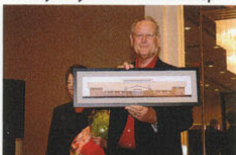
Local 211 Building Dedication Kenneth Edwards School Annex